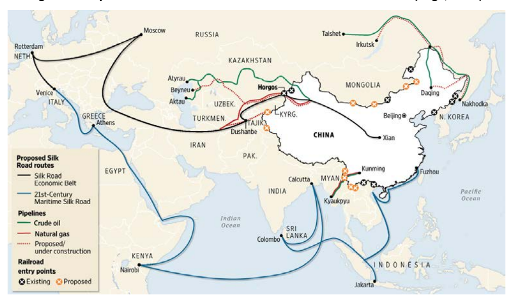
Figure 4: Map of the course of land and maritime The New Silk Road (Page, 2014)

Improving logistics infrastructure means investing in certain nodes of transport network as seaports, airports and linear infrastructure: road and rail links. While important for the economy of the country is increasing the efficiency of logistics in the area of China through connecting further areas of this gigantic country, it is crucial to minimizing the logistical problems of global supply chains to improve connections running outside of the area of China. In order to facilitate transport operations it is prepared a recovery plan of the known, historical Silk Road.