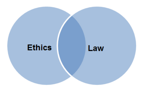
Fig.1: The Relationship between Code of Ethics and Legal Terms(Tone 1995)

Code of ethics and legal terms have some points in common, but they are different in many aspects. For example, in the past slavery was considered immoral but no law on its prohibition ruled. Moreover, ethics is neutral toward some issues. For example, there is no moral code for keeping right on road because it is an issue that cannot be called wrong or right. It has a rule which dictates the opposite and morality only affects the result and not formulation of rules. In general, the differences between these two fields are as follows(Tone 1995).