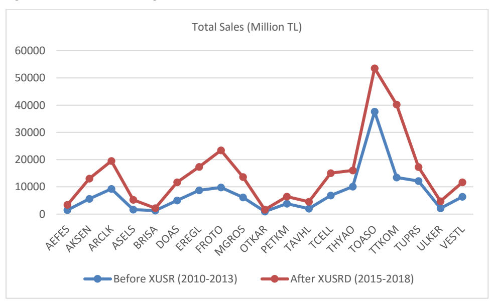
Figure 2: The Trends of Average Sales Revenue

Average values of sales revenues of companies are as shown in Figure 2. As can be seen from this figure, sales similar to current assets do not decrease in any firm. However, only the increase in the current assets and sales of the companies does not show that these companies carry out effective working capital management. Therefore, in this study, the Index model is used to determine the effectiveness of working capital management.