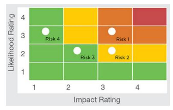
Figure 1: Risk Severity in Heat Map

or duration, even if both risks are considered equal in severity. Thus, in responding risks, both severity of the risk, and priority, i.e., comparative evaluation in velocity and persistence, should be considered (COSO, 2017). Therefore, risk responses can be determined by considering risk appetite, risk severity, risk prioritization, costs and benefits of risk responses, obligations and expectations and business context (COSO, 2017). A very common illustration for risk severity, a heat map, can be found in Figure 1.