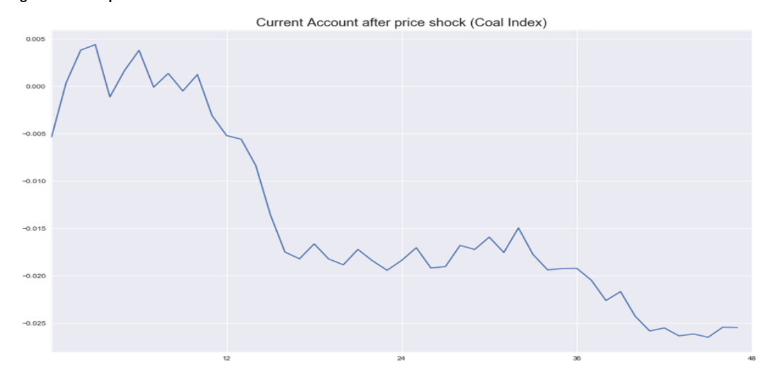
Figure 2: The Impact of One Standard Deviation Increase in Coal Prices on the Current Account Balance